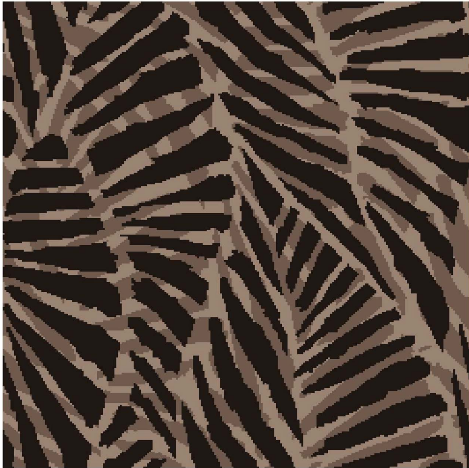
AX-TILE 9940D 0.88M x 0.88M